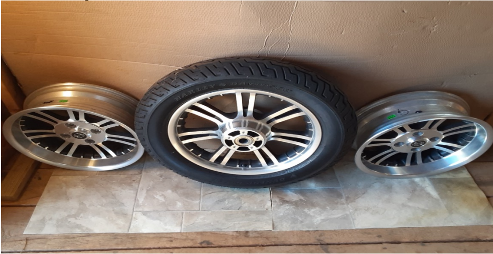
Motorcycle trike front rim/tire with 2 rear rims. Less than 3000 mile. $500 call Tony at 966-3752